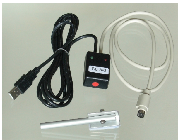
The USB Silverlink 3 Plus