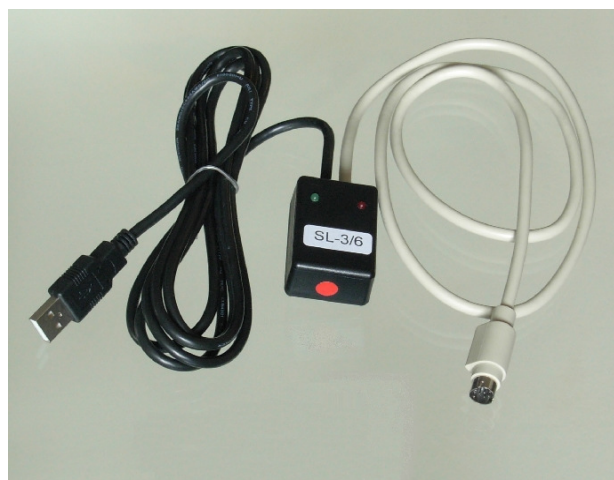
The USB Silverlink 3